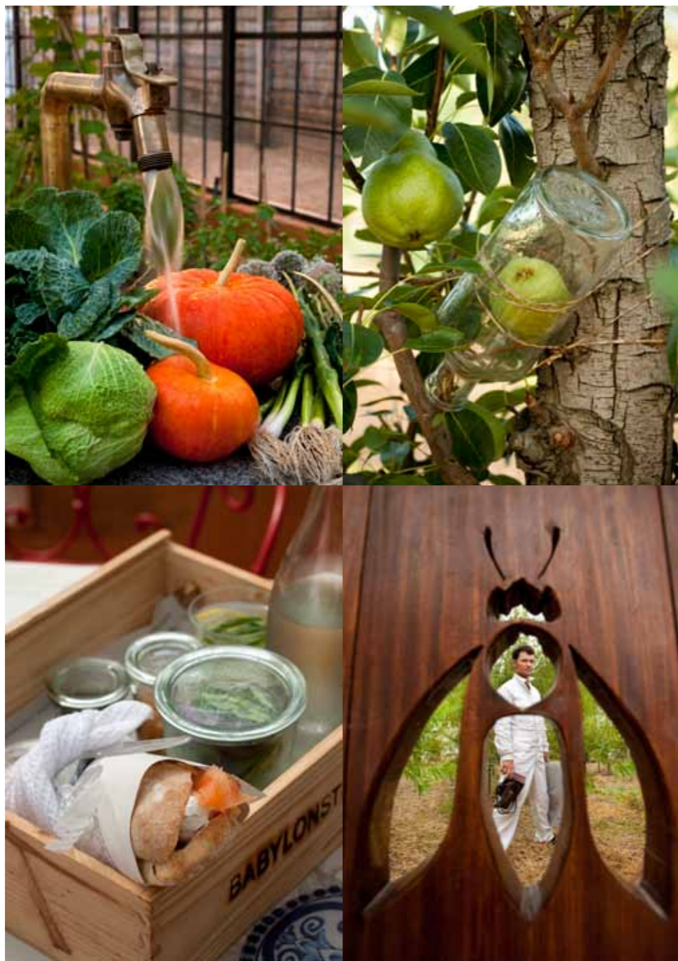
CLOCKWISE FROM TOP LEFT Pumpkins, cabbage and onions from the garden; A few small pears were covered with glass bottles in November to make pear wine or brandy; Babylonstoren's beekeeper, Voytek Modrzewski, seen through the door of the beehive; Lunch for one: a fresh salmon and yoghurt cheese sandwich wrapped in a paper placemat, with imported Weck glass containers filled with garden salad and baby vegetables, yellow plum chutney and herb oil. OPPOSITE The conservatory was erected between massive existing English oaks. Additional medium-sized turkey oaks and Algerian oaks were planted to provide extra shade in summer.

breeze and sit some more and be happy – a place you don't want to leave.'