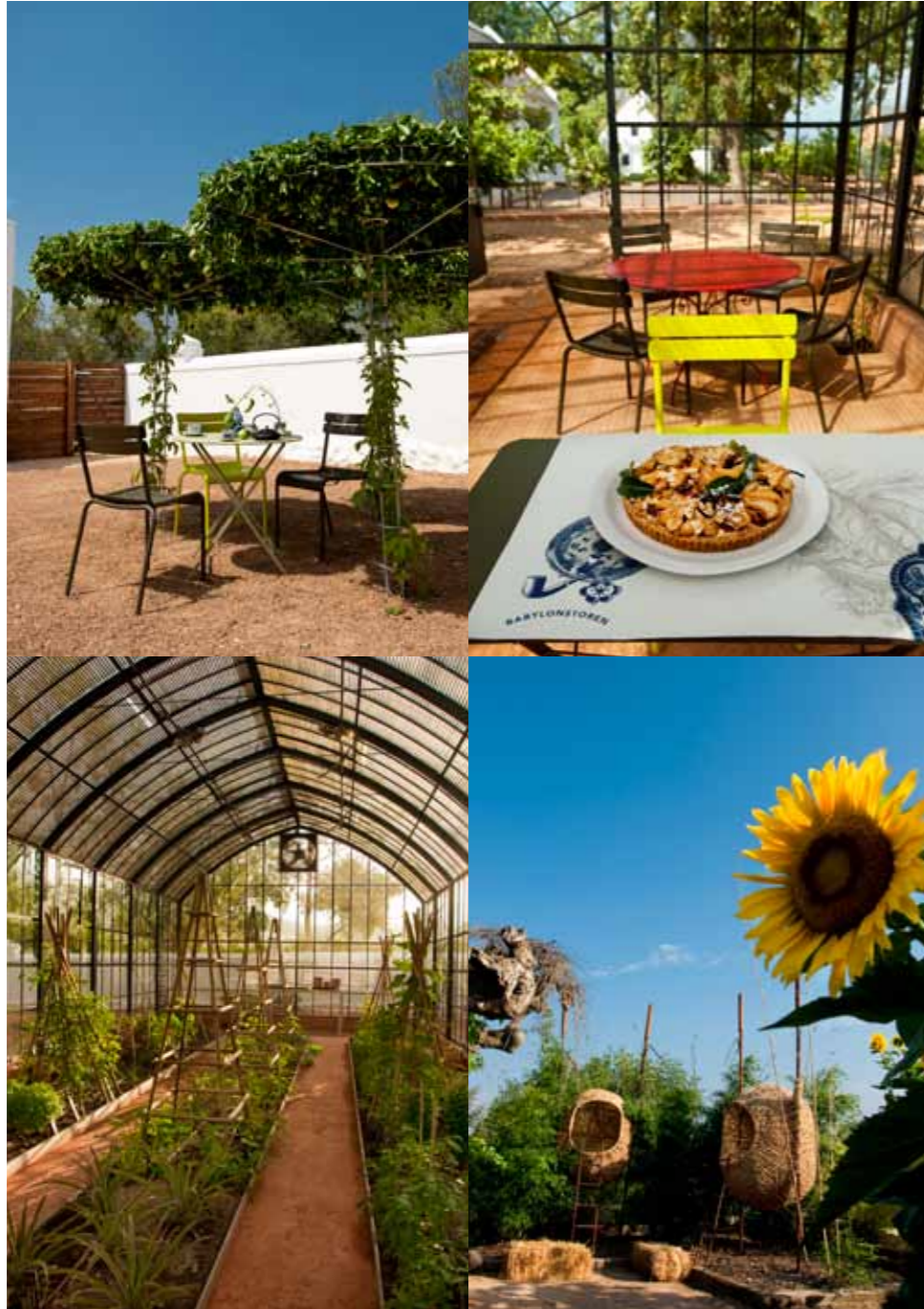
CLOCKWISE FROM TOP LEFT A seat under the granadilla “tree”; Filtered light falls through the conservatory; Nests by Animal Farm’s Porky Hefer provide a quiet place to hide away; Exotic granadillas, pineapples and vanilla are amongst the species being tested out in the conservatory; OPPOSITE The blue Delft motif is repeated throughout Babylonstoren.