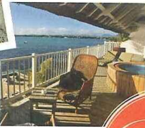
Above: the where's hot map. Right: 20 Degrés Sud.