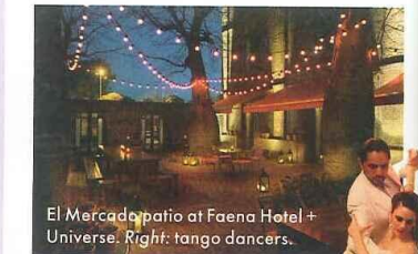
El Mercado patio at Faena Hotel + Universe. Right: tango dancers.

An 80-foot-long streak of sleek white. Don't fall off the bar stools—the cocktails are lethal—which are adorned with six different eye images, taking the phrase "all eyes on you" to a new level. sandersonlondon.com