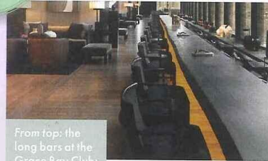
From top: the long bars at the Grace Bay Club; the PuLi; Raffles; the Sanderson.